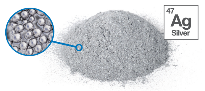
*Eliminates 99.9% of bacteria within 24 hours

This technique actively works to keep the surface bacteria free for the lifetime of the product making it ideal for a variety of applications in public spaces such as schools, workplaces, airports, public restrooms, healthcare facilities and any demanding environments where cleanliness is vital.